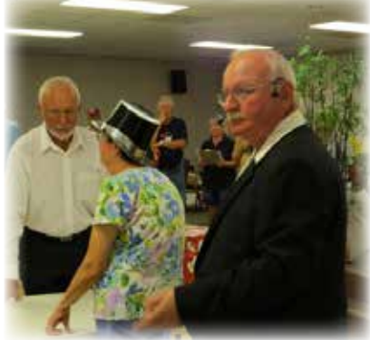
SERENDIPITY SENTINEL APRIL, 2018 N